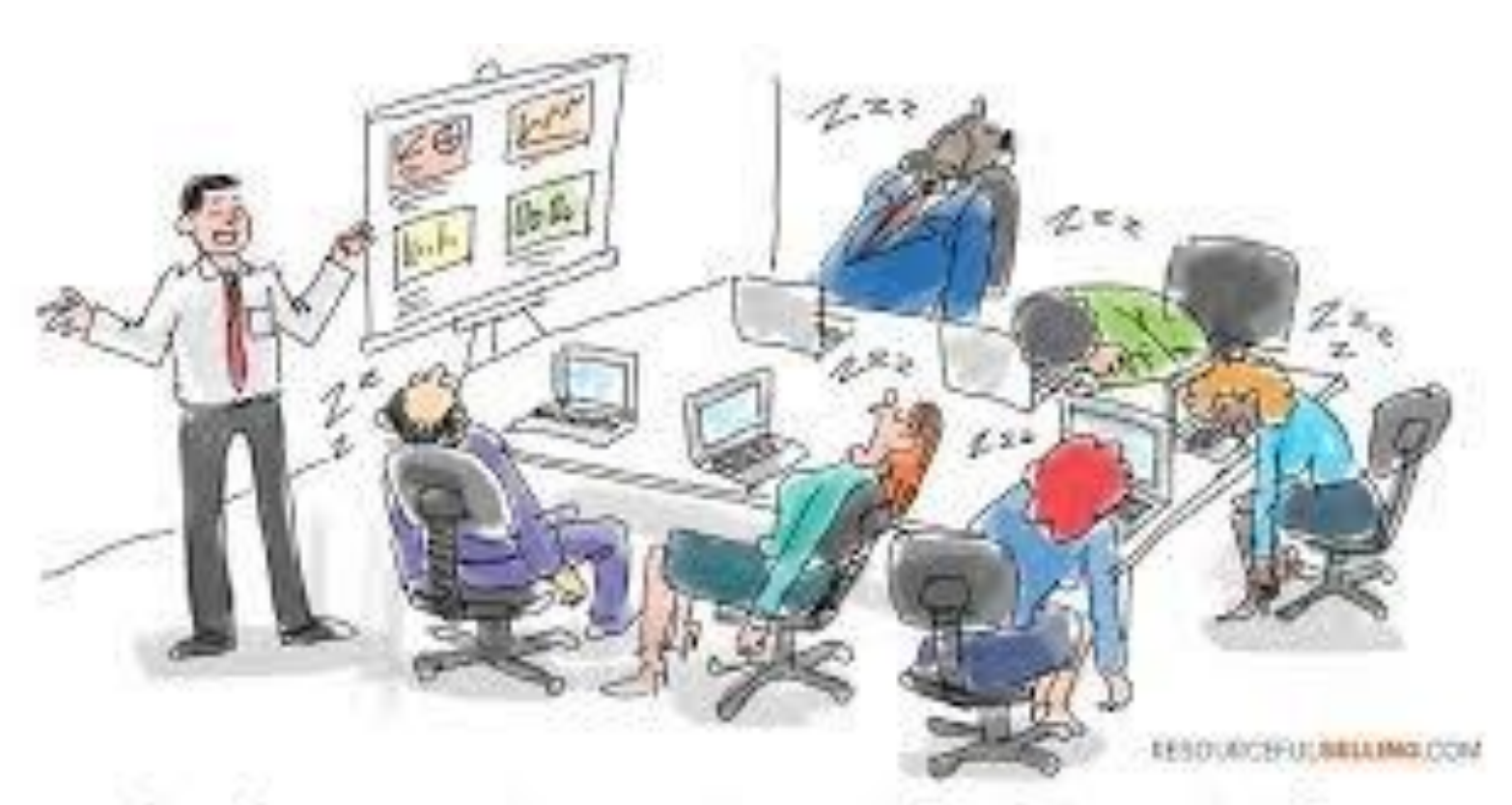
"THAT'S THE END OF MY PRESENTATION, ANY QUESTIONS?"