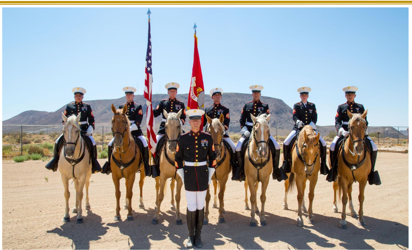
Welcome to MCLB Barstow!